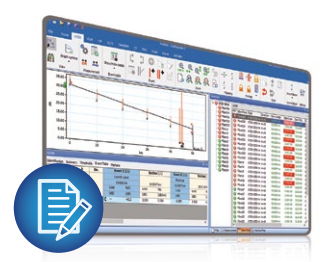
Editing multiple measurement files