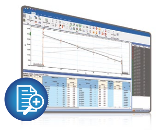
Analyzing multiple measurement files